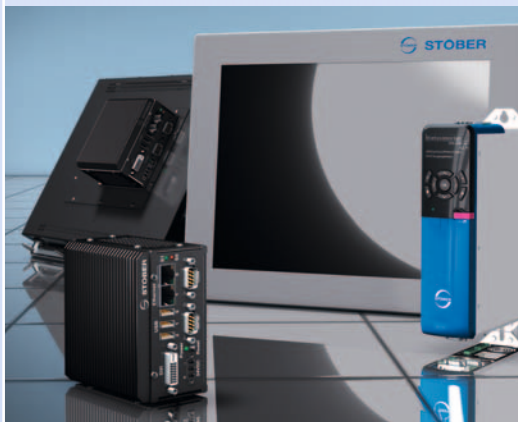
Complete STOBER solution for a multi-axis solution.

A system solution from STOBER carries long-term cost reduction advantages.